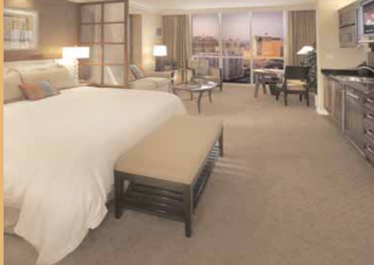
Junior Suite Parlor